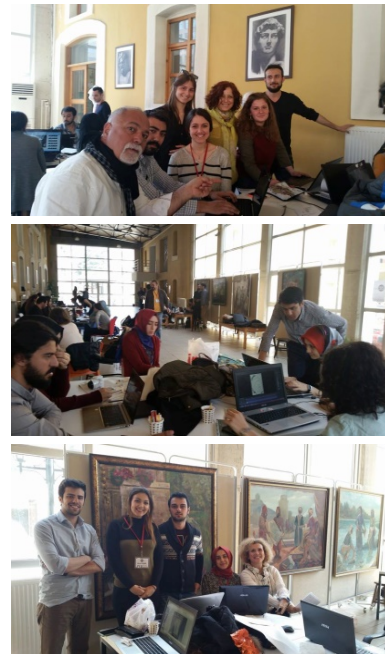
Figure 16. Workshop Photos (Sudas, 2015)

The workshop work of S'OZ Bizde, which Mimar Sinan Fine Arts University, Erciyes University and Yildiz Technical University students, which was made by Fikir Art Design Club within the scope of KTU Faculty of Architecture, was held between 16-19 April 2017. Lost and ignorant, the question of what was brought about the Oz was questioned, awareness was formed. Problems were identified and new products were introduced (Sudas, 2015).